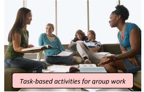
Task-based activities for group work