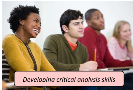
Developing critical analysis skills

Our EAP courses are also carefully structured to teach essential academic English skills in the following key areas.